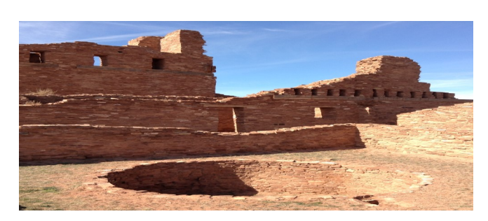
Abo Mission, New Mexico