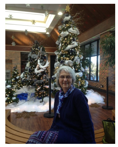
Texas Christmas tree