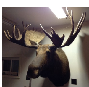
A moose in Michigan