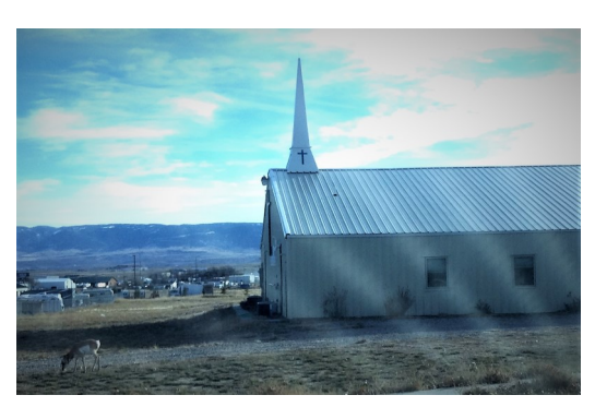
Wyoming—Can you spot the antelope?