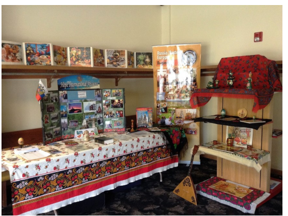
Russian Mission Display in Kansas