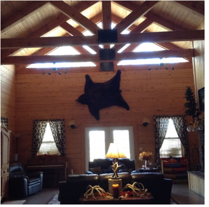
A grand house by Grand Mesa, Colorado