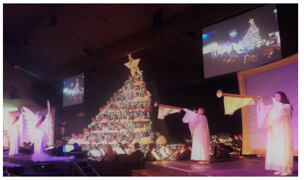
Singing Christmas Tree Finale